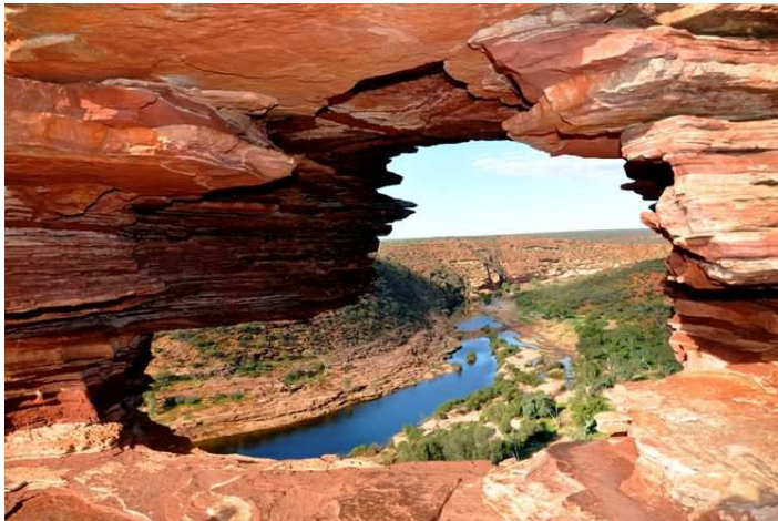
Kalbarri National Park