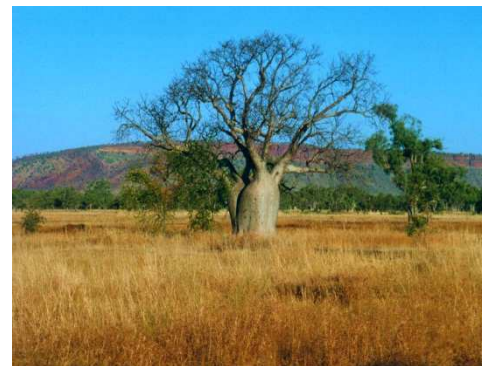
A boab tree in the Kimberley