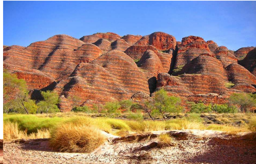
The Bungle Bungles