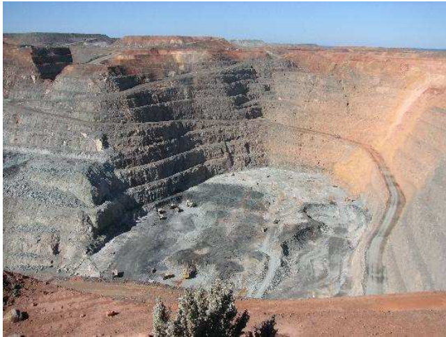
Mining in Kalgoorlie