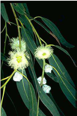
Tasmanian blue gum