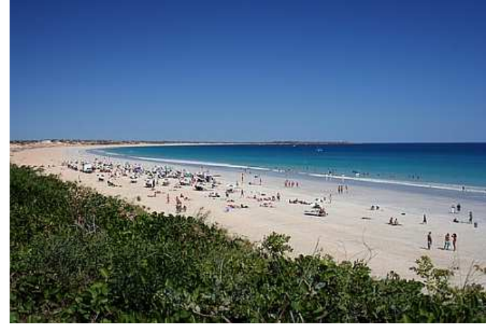
Cable Beach, Broome