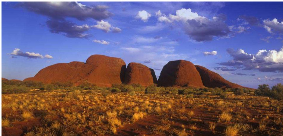
Kata Tjuta / The Olgas