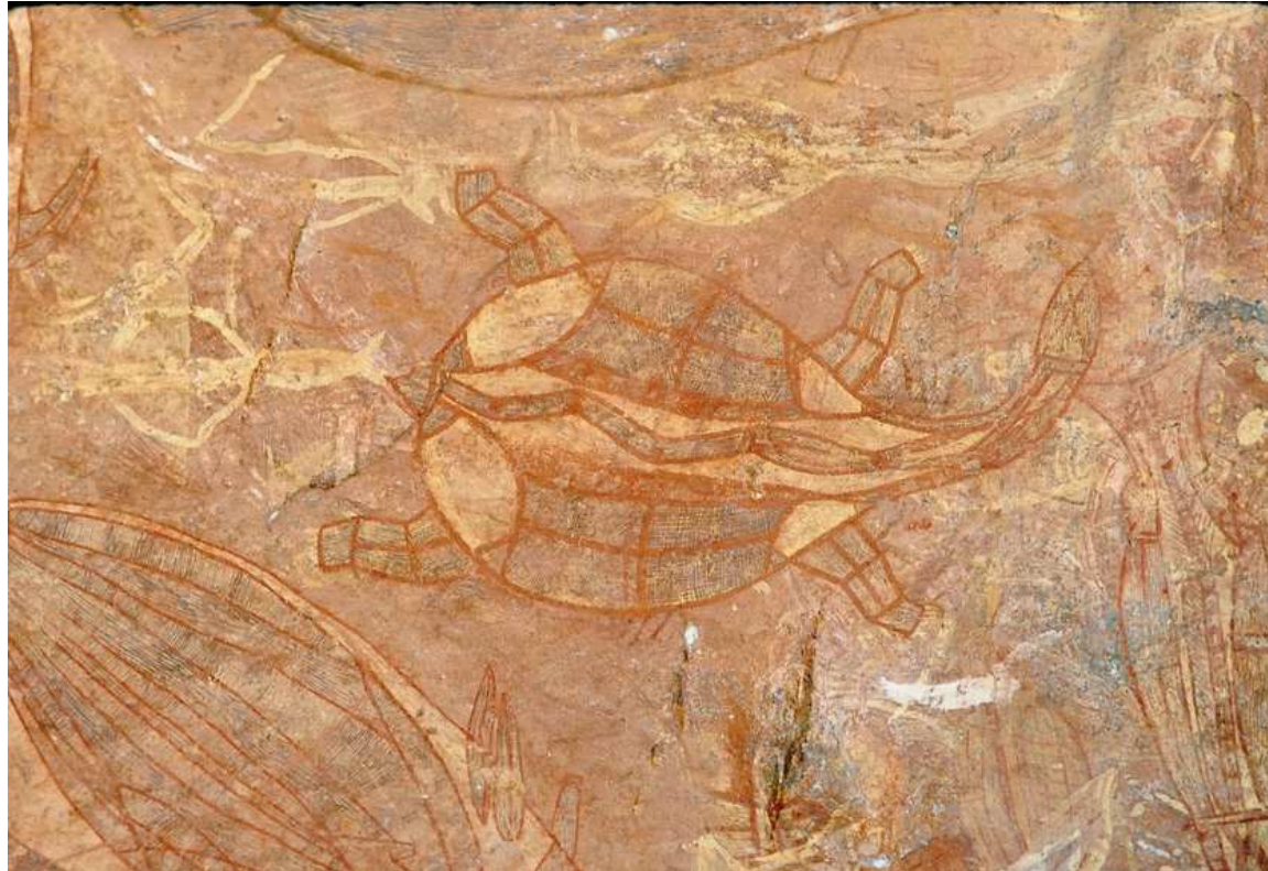
Aboriginal rock art