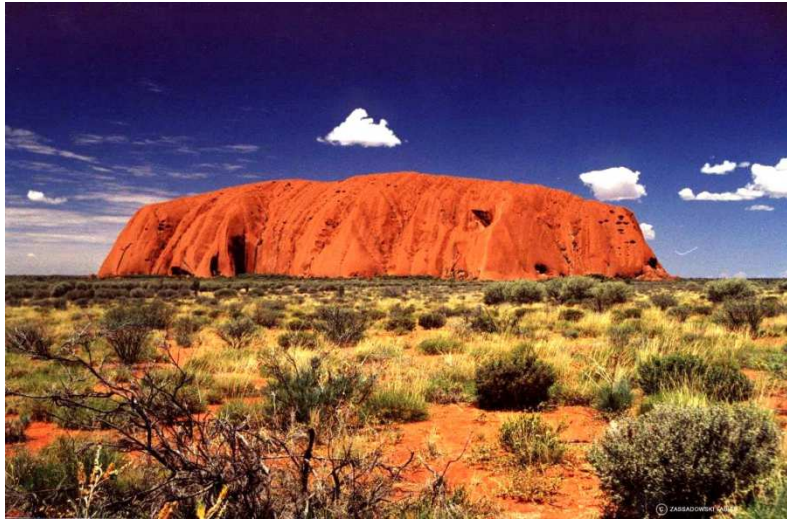
Uluru / Ayers Rock