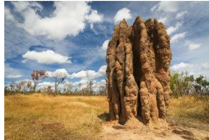
A termite mound