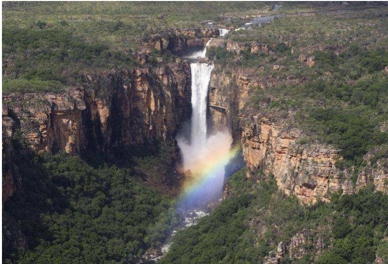
Jim Jim falls