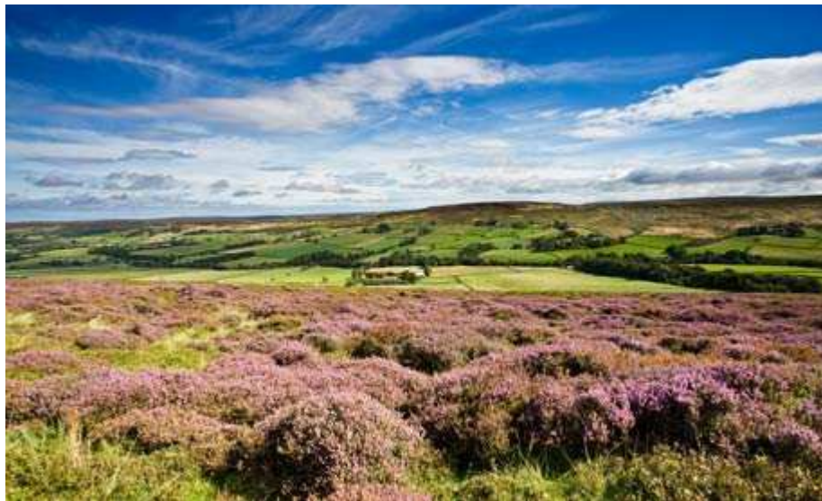
Heather in bloom in the North York Moors National Park